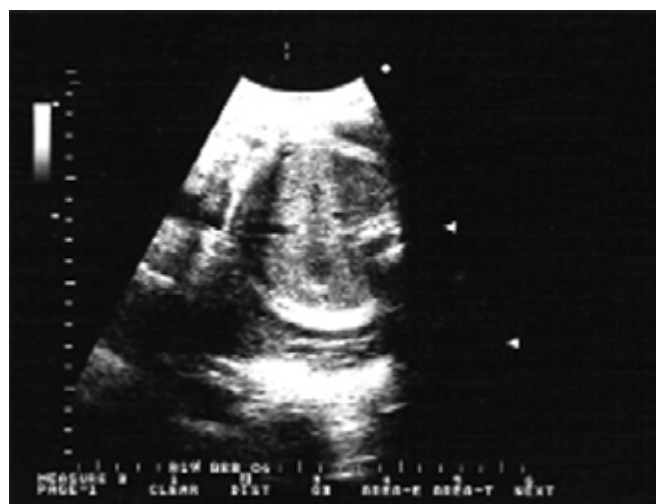
Fig 5. Transverse view of the fetal abdomen at 22 weeks' gestation.