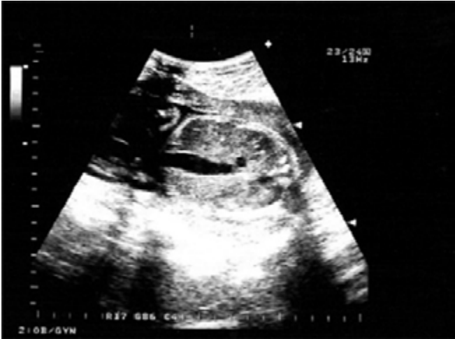
Fig 1. Transabdominal ultrasound shows the increased diameter of the affected umbilical vein.