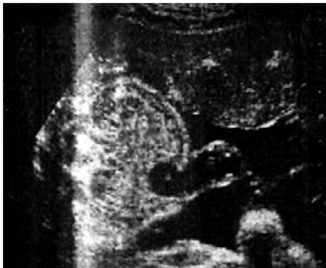
Fig 3. Varix (asterisk) of the umbilical vein.